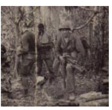
Note: These were the only group pictures received prior to this publication.